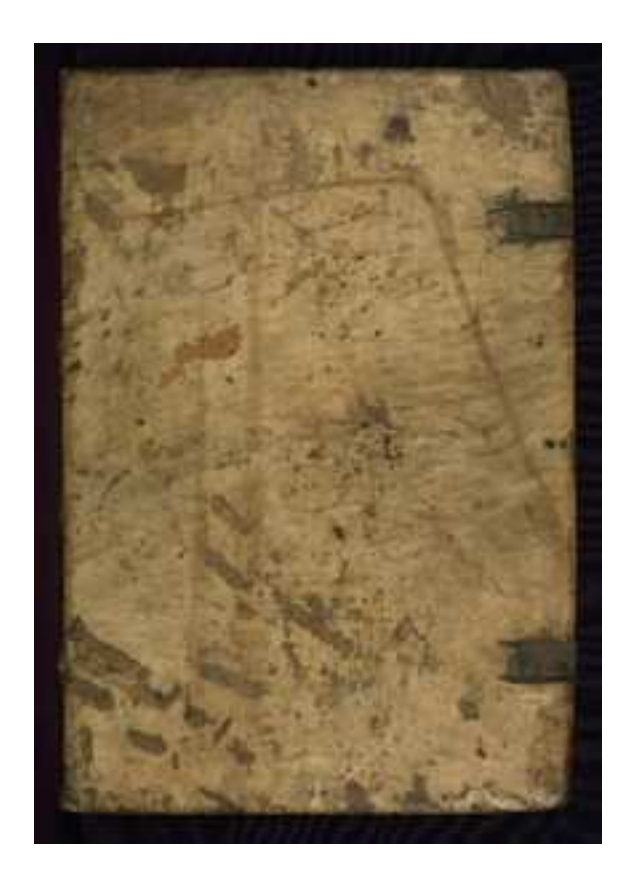
Published by: The Walters Art Museum 600 N. Charles Street Baltimore, MD 21201 http://www.thewalters.org/